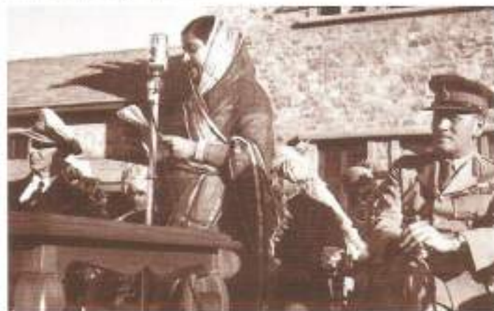
Opening Address Being Read Out by the Maharani