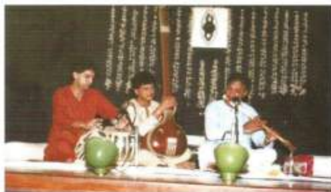
Pandit Hari Prasad Chaurasia Performing at INS Valsura