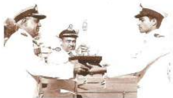
A Young 'Old Man' Receiving the Best All Rounders Trophy