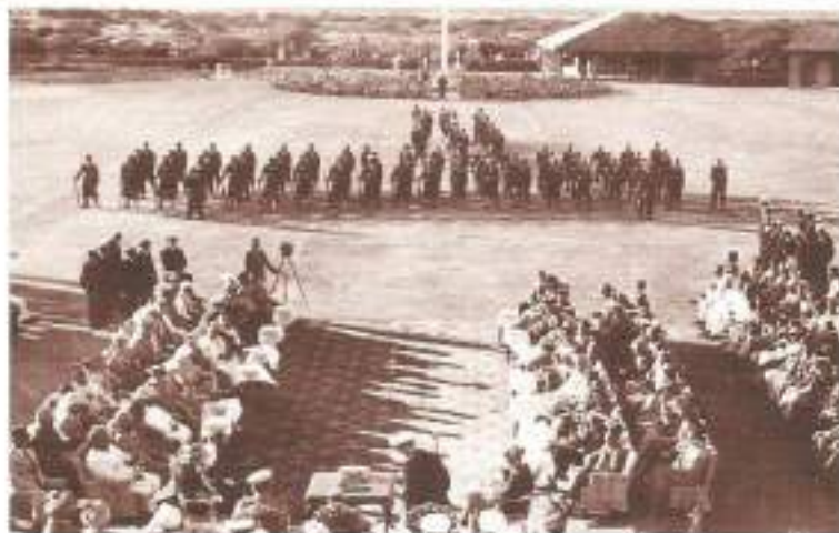
Ceremonial Guard of Honour Forming Up.