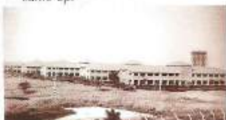
Inliving Sailors Blocks as they came up

Over a period of time, due to increased commitments in training, need was felt for more space for classrooms, equipment rooms, storeroom etc. Also, the wartime complement of officers and ratings was inadequate for training and administrative functions. The parade ground was also found to be small as the strength of the trainees increased. Hence, it was decided in late 50's that a new parade ground be constructed in front of the Digvijay block (present Electrical Technology School). Slowly, additional facilities like pump house, power supply unit, Family Welfare Centre, Sailors Institute, cinema hall, accommodation for sailors and officers families, Wardroom Mess, sailors block etc came up.