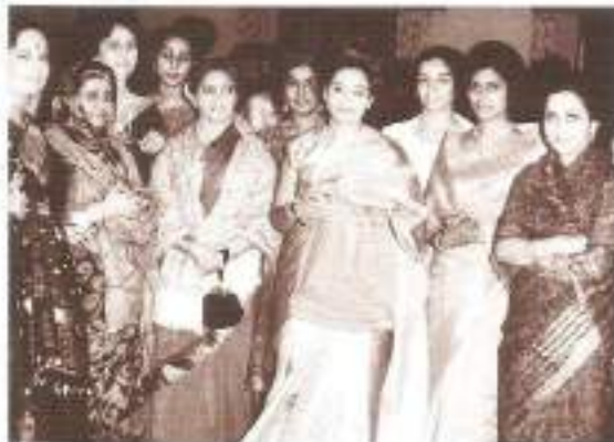
Ladies Decked up for Silver Jubilee Ball