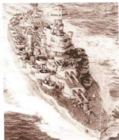
HMS Dreadnought – One of the First Ships Where Electricity Was Widely Used.

Towards the end of the nineteenth century, the Admiralty appointed an electrician at Portsmouth Dockyard to advise them on electrical matters and instituted a committee to look into the potentialities of this new form of energy. It was also during this period that for the first time four Naval vessels were equipped with communication equipment with a range of about 70 miles. Ships grew in size till they reached the "Super Dreadnought" class in World War I.