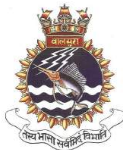
Crest of INS Valsura

However, the Jamsaheb was keen that Valsura continued in its present location. He, therefore, decided to seal the argument by donating another 600 acres of land on the same terms. The Jamsaheb was an influential person in the Government of India. He, therefore, ensured that Valsura continued where it was and in due course it changed from "Torpedo and Electrical" School to "Electrical School".