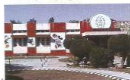
School for the 'Little Angels'.

The base slowly grew into a township and Valsurians felt the need for suitable educational facilities for their wards. The fact that Valsura was at considerable distance from Jamnagar town made it imperative that decent schooling be available within the precincts of the establishment. This led to the setting up of a Naval KG School, initially called Bal Vatika and also a Kendriya Vidyalaya.