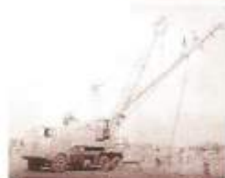
The Mast Being Erected

A list containing the names of persons associated with the erection the mast was made on a scroll, pushed inside a rum bottle and the bottle placed inside the mast.