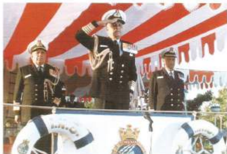
Admiral L Ramdas, CNS Taking Salute at the Golden Jubilee Divisions