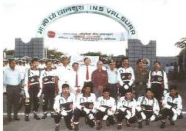
Members of the INS Valsura All India Motor Cycle Expedition