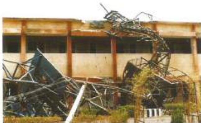
COMCEN Tower Bent Beyond Recognition

All this while, the time tested procedures that are inherently instituted in the system to deal with emergencies like this, were being put in place. Power