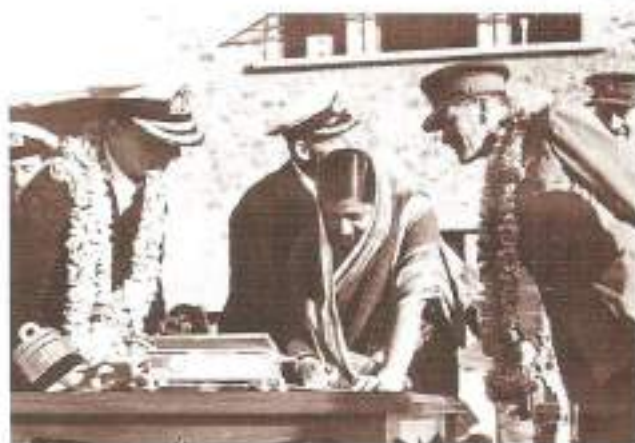
The First Signature in the Visitors Book