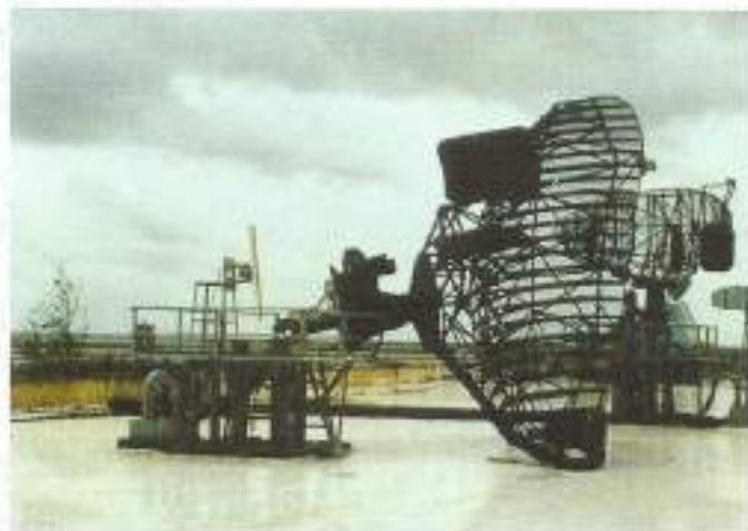
Radar Antenna Damaged After Cyclone

When I read this message to the Ship's company whom I fondly remember even now, I was indeed overwhelmed and charged with emotional sentiments. Sixty years ago someone coined a motto for HMS Valsura when it was the Royal Navy's Torpedo School – "VALSURA SEMPER VIRET". It seems only too apt to understand its meaning even now – "VALSURA SHALL ALWAYS BE VICTORIOUS".