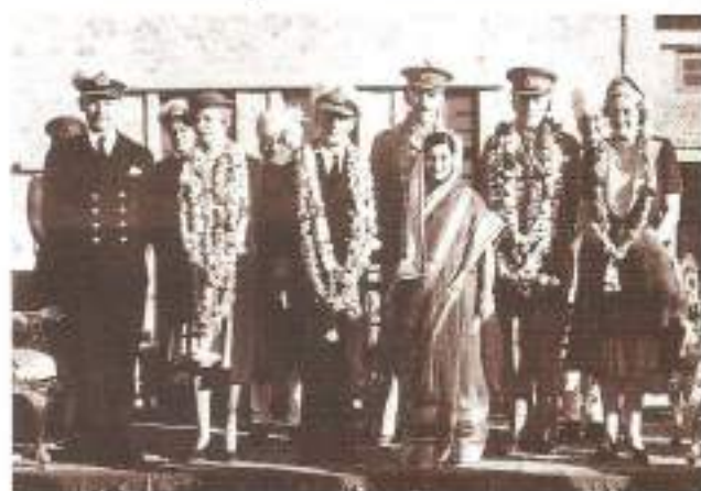
Maharani with Garlanded Dignitaries