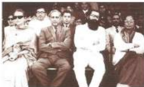
The Present Jamsaheb (Second from Right) During Silver Jubilee Celebrations