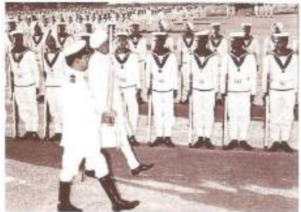
Inspection of Guard During the Silver Jubilee Divisions