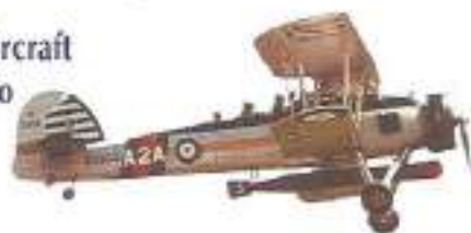
Swordfish Aircraft With Torpedo

This article was penned exactly ten years ago for the Golden Jubilee issue of Quarterdeck