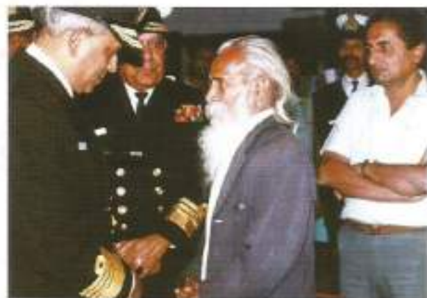
Admiral Ramdas CNS With Father of Khukri Martyr