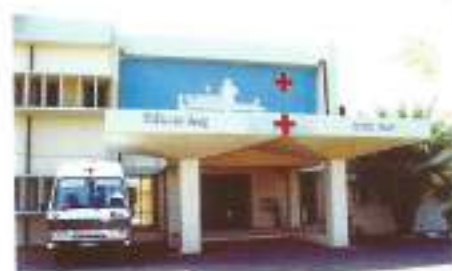
Dhanvantri - The Sick Bay

The Indo-Pak conflict of 1965 led to the Navy acquiring a large number of ships of various types. As a result, there was a great diversity in the types of equipment in service. By end '79 most equipment was installed and commissioned in the Electrical Equipment School and practical training also commenced. To overcome certain drawbacks, the training department was reorganised with three schools, namely Basic Electrical School, Electrical Technology School and Electrical Equipment School, imparting training at various stages. By Mar 80, the Training Department became a closed loop system with the Training Evaluation Cell. In order to keep abreast with the advances and latest developments in information technology, a Centre for Advanced Training (CAT) was setup.