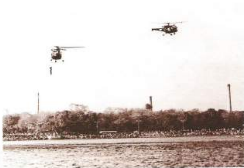
Naval Choppers in Action Over Kankaria Lake

On D Day, Kankaria Lake was jam packed! So much so that we had to air lift the Governor to his place for the fly past. There was no way we could have driven him through the milling crowds.