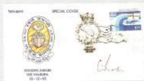
The Golden Jubilee First Day Cover