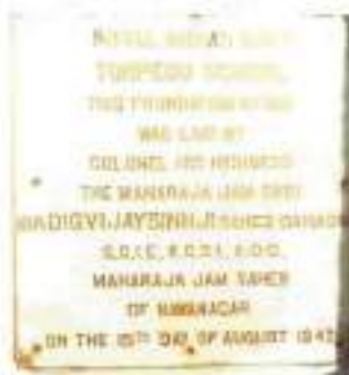
Foundation Stone Aug 42