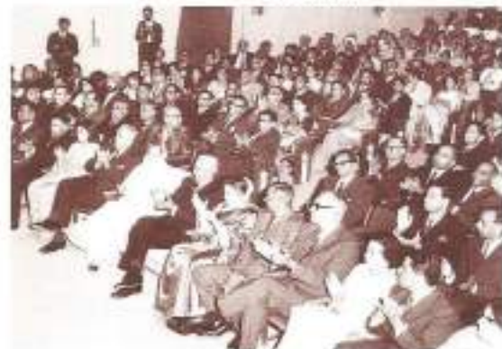
Section of the Audience Viewing the Cultural Programme During Silver Jubilee