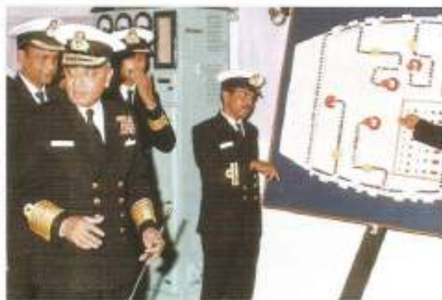
CNS at the Technology Museum