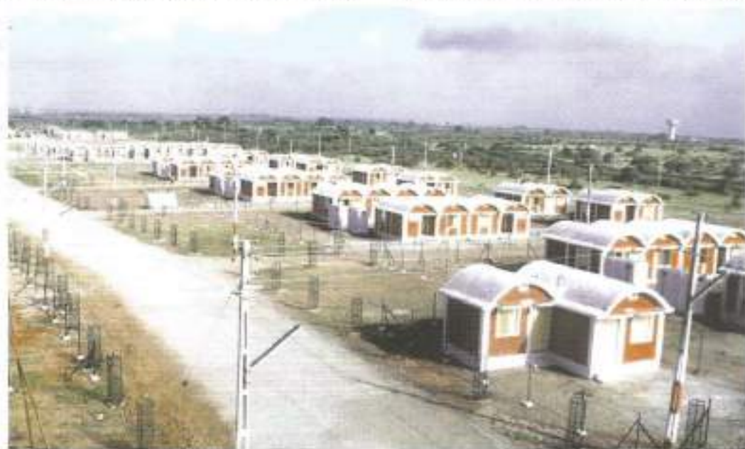
The Navy Moda Village

There were extensive damages to all buildings and the aftershocks during the subsequent weeks kept many in tents pitched all around the base. But true to Naval tradition, Valsurians rose like a phoenix and lent a helping hand to the nearby villages and hospitals. Then came 'NaiRoshni' the project to rebuild and relocate the earthquake ravaged village Moda as 'Navy Moda'. With the help of Centre of Science for Villages (CSV), a NGO, in a record 111 days a near township was created with 110 houses, school, community centre, shops and asphalted roads. NWWA Valsura played a stellar role in rehabilitating the village ladies and motivating the families for relocation. The Governor of Gujarat, Shri Sundar Singh Bhandari inaugurated the new