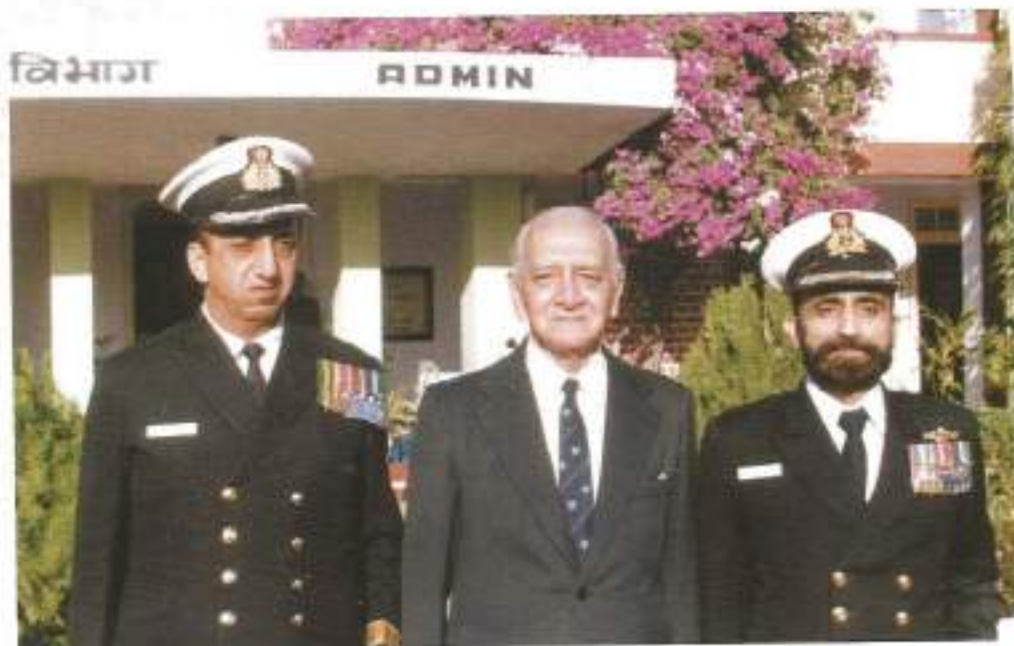
Three Ex COs Meet During Golden Jubilee.