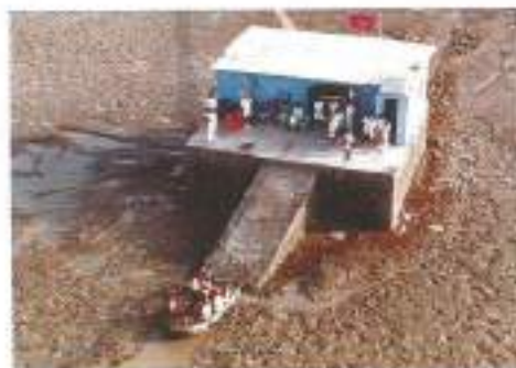
Aerial View of Watermanship Training Complex

Necessity is the mother of invention. Soon the idea dawned to make a boat shed approx 100ft in to the sea from high tide line having storage place for the boats and open space for rigging and a ramp to lower the boats into water. The State government was approached to lease an area in the sea for this purpose which materialized without much delay. The sea bed in Kutch has about 5/6 feet of mud which has to be removed for the foundation to have support of hard ground, but that didn't deter us from our venture. Stones and rubble were filled from the shoreline. The masonry work used to begin the moment the tide receded and had to stop one hour before flooding. The building, the ramp and the platform were ready within four months.