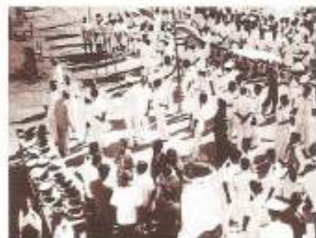
Silver Jubilee Barakhana