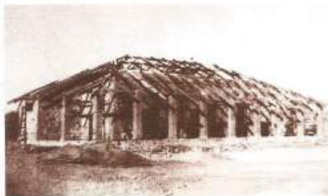
The First Few Buildings Coming Up

So the construction activity started at a feverish pace and the first set of buildings were ready in just four months.