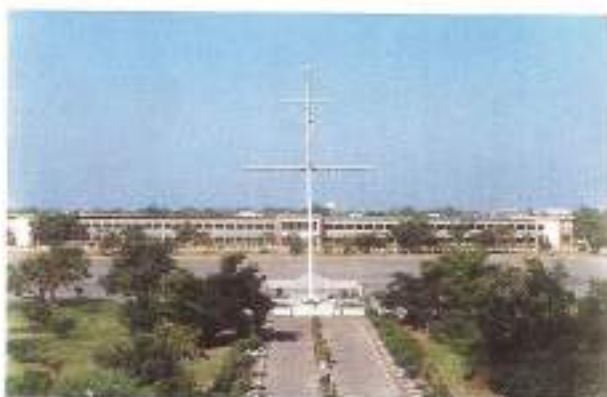
The Mast as it Looks Today

A list containing the names of persons associated with the erection the mast was made on a scroll, pushed inside a rum bottle and the bottle placed inside the mast.