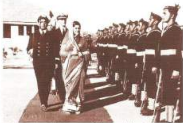
Inspection of Ceremonial Guard by Maharani