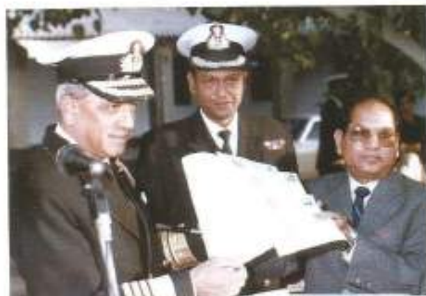
Release of First Day Cover by CNS