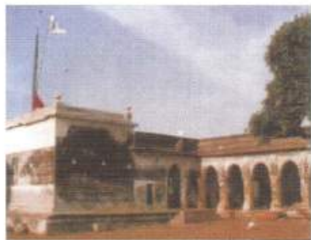
Rozi Mata Mandir, the Royal Deity of the Jam Royals

The area selected for the School was on the Island of Rozi, which was uninhabited except for the Rozi Port. There were, however, some places of worship, mainly on the periphery of the island facing the sea. The main area was the temple of Rozi Mata, which gave the region its name.