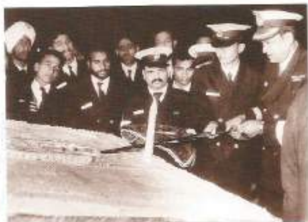
Cutting the Golden Jubilee Cake