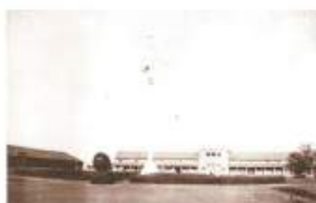
View of Valsura - circa 54

On 29 Jul 44 , a small party of Electrical Lieutenants RINVR , including myself , reported at HMIS Valsura for a course in Naval Electrics. At first sight the Torpedo School brought to my mind, cinematically, the remote outpost of a far flung empire. Flanked on three sides by the dense scrub jungle of the game reservation and on the fourth by salt pans, the School was approached by a narrow road . Through the main gate one glimpsed a flag-staff, parade ground and grey stone hutments.