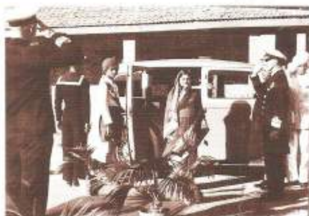
The Maharani Arrives for the Ceremony