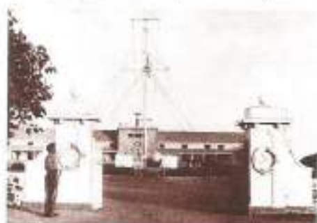
The Old Flag Staff

The original quarterdeck and parade ground was in the centre of the Torpedo School with buildings on three sides. The quarterdeck had a wooden mast 47 feet high and the top mast had an upper arm and truck. The lower mast had a yard and a gaff.