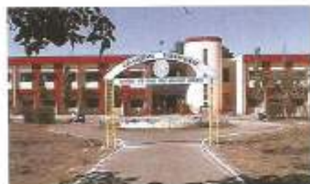
The KV Valsura as it stands today

The Indo-Pak conflict of 1965 led to the Navy acquiring a large number of ships of various types. As a result, there was a great diversity in the types of equipment in service. By end '79 most equipment was installed and commissioned in the Electrical Equipment School and practical training also commenced. To overcome certain drawbacks, the training department was reorganised with three schools, namely Basic Electrical School, Electrical Technology School and Electrical Equipment School, imparting training at various stages. By Mar 80, the Training Department became a closed loop system with the Training Evaluation Cell. In order to keep abreast with the advances and latest developments in information technology, a Centre for Advanced Training (CAT) was setup.