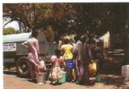
Valsurians Queue up For Water

With Kargil behind us, Gujarat and Valsurians took the summer of 2000 – the last summer of the century – head on. The Government declared it "Drought of the Century".