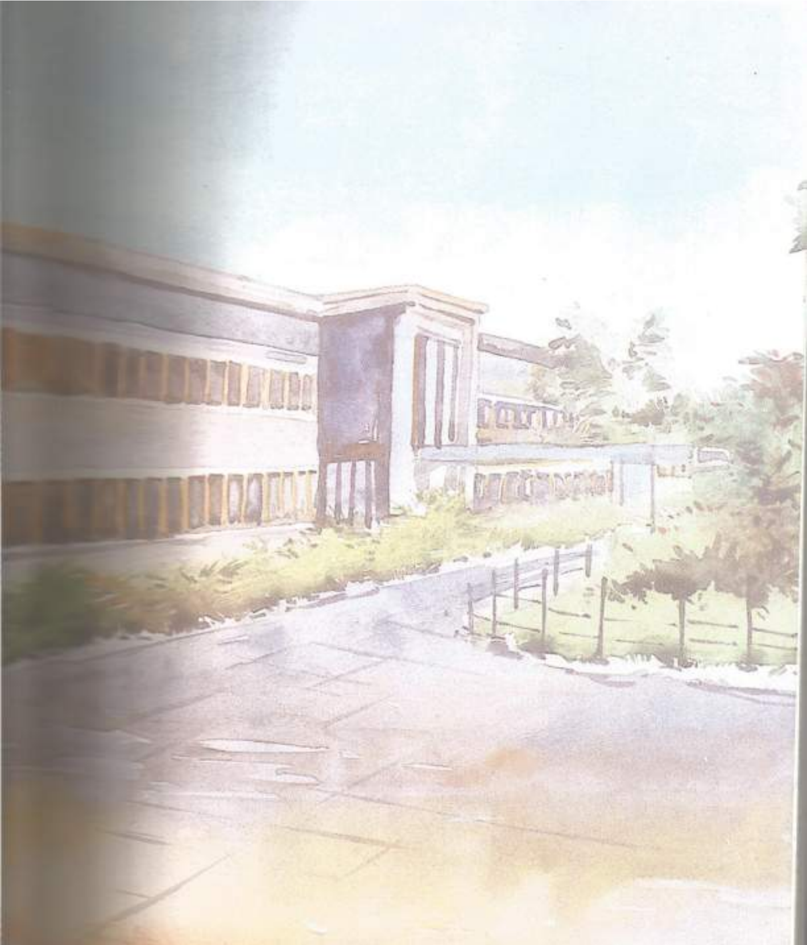
An artists impression of Electrical Technology School