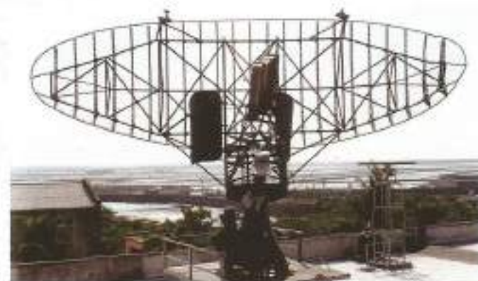
Radar Antenna Restored