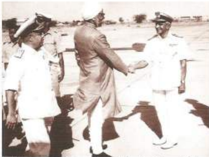
Raksha Mantri Being Received for the Silver Jubilee