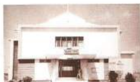
Valsura Cinema as it came up

Over a period of time, due to increased commitments in training, need was felt for more space for classrooms, equipment rooms, storeroom etc. Also, the wartime complement of officers and ratings was inadequate for training and administrative functions. The parade ground was also found to be small as the strength of the trainees increased. Hence, it was decided in late 50's that a new parade ground be constructed in front of the Digvijay block (present Electrical Technology School). Slowly, additional facilities like pump house, power supply unit, Family Welfare Centre, Sailors Institute, cinema hall, accommodation for sailors and officers families, Wardroom Mess, sailors block etc came up.