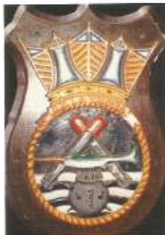
Crest of HMIS Valsura

The name chosen for the new Torpedo School, Valsura, was derived from the combination of two Tamil words 'Vaalu' meaning sword and 'Sorrh' meaning fish. The choice of the name Valsura was considered appropriate because a variety of swordfish is actually found off the coast of Saurashtra, and Swordfish was also the name of a famous World War II torpedo carrying aircraft. The crest of the newly started school showed a swordfish placed amidst two crossed torpedoes and a mine with the Latin motto " Valsura Semper Viret ", meaning "Valsura shall always be victorious".